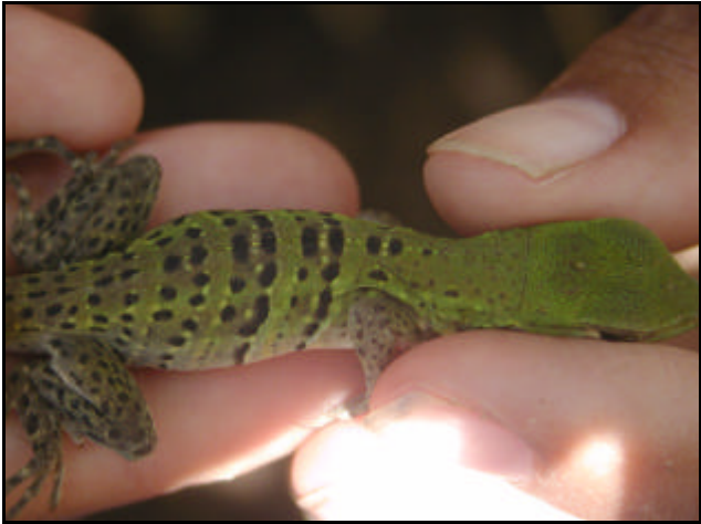
Hatchling Black Iguana ( Ctenosaurus similis )