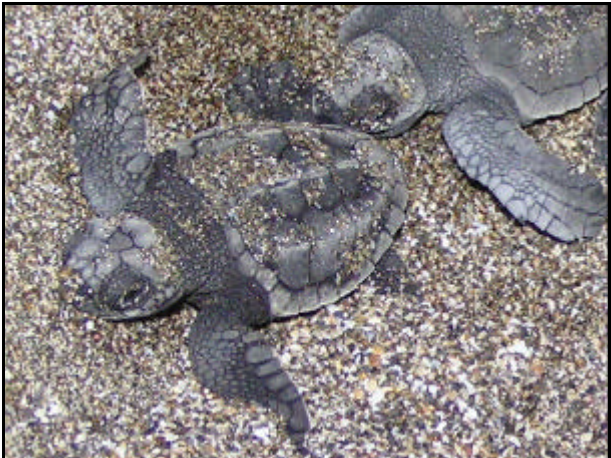
Hatchlings Olive Ridley ( Lepidochelys olivacea )