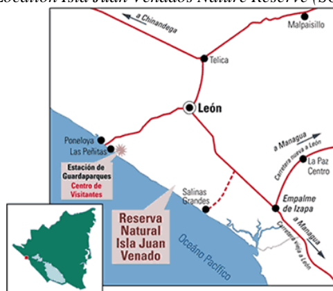
Figure 1. Location Isla Juan Venados Nature Reserve

Isla Juan Venado Reserve lies at the northwest of Nicaragua in the Leon province covering an area of 2.934 ha (figure1). The area is dominated by mangrove forests and a extensive estuary with some areas of savannah, tropical dry forest, coastal habitats and agricultural land. A 20 km beach provides nesting area for five species of marine turtles. The nearest major settlements is the colonial city of Leon (20 km) and Managua (120 km). There have been few studies undertaken in the area and little is known of the exact biodiversity value. The current management plan lacks an inventory list of mammal species inhabiting the reserve.